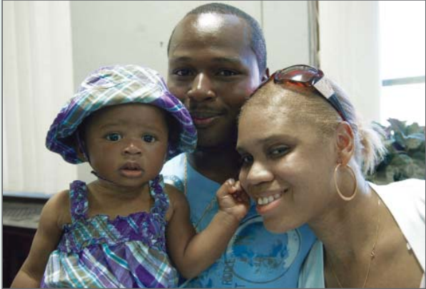
Parent Café newcomers discover creative nutritional recipes at The Parent Café

The school becomes a hub, a kind of pillar, a light in the community that people have. They can be involved in something positive after school and on weekends.